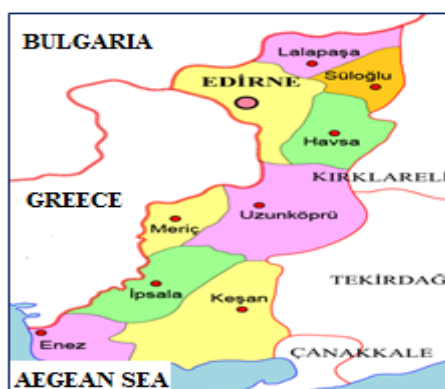
Figure 1. Map of Edirne

The province of Edirne, which is located in the Thrace part of the Marmara Region, was chosen as the study area. It is surrounded by the Aegean Sea in the south, Bulgaria in the north, Greece in the west and Kırklareli in the east as shown in Fig. 1. The province has a surface area of 6 000 km 2 and hosts approximately 411 thousand people [8].