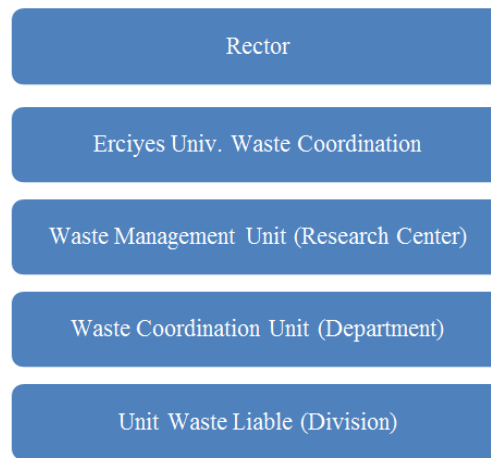
Figure 1. Erciyes University waste management hierarchy

Erciyes University's waste management directive has a management hierarchy as shown in Fig. 1. In this, the main coordination is operated by Environmental Problems and Cleaner Production Research Center. There are responsible personals in departments and other research centers. There are also responsible personals in sub-divisions in these coordination units.